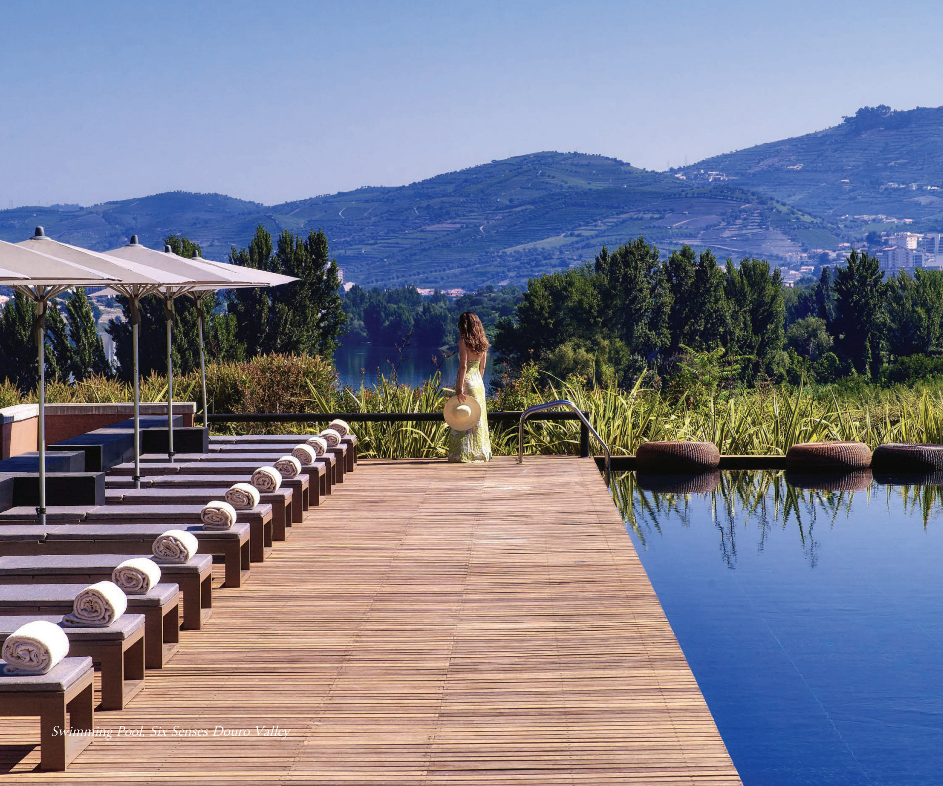
Swimming Pool, Six Senses Douro Valley