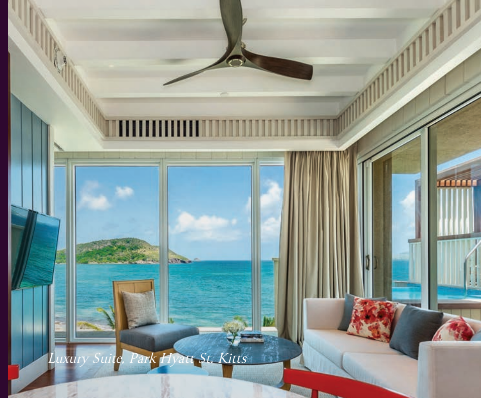
Luxury Suite, Park Hyatt St. Kitts