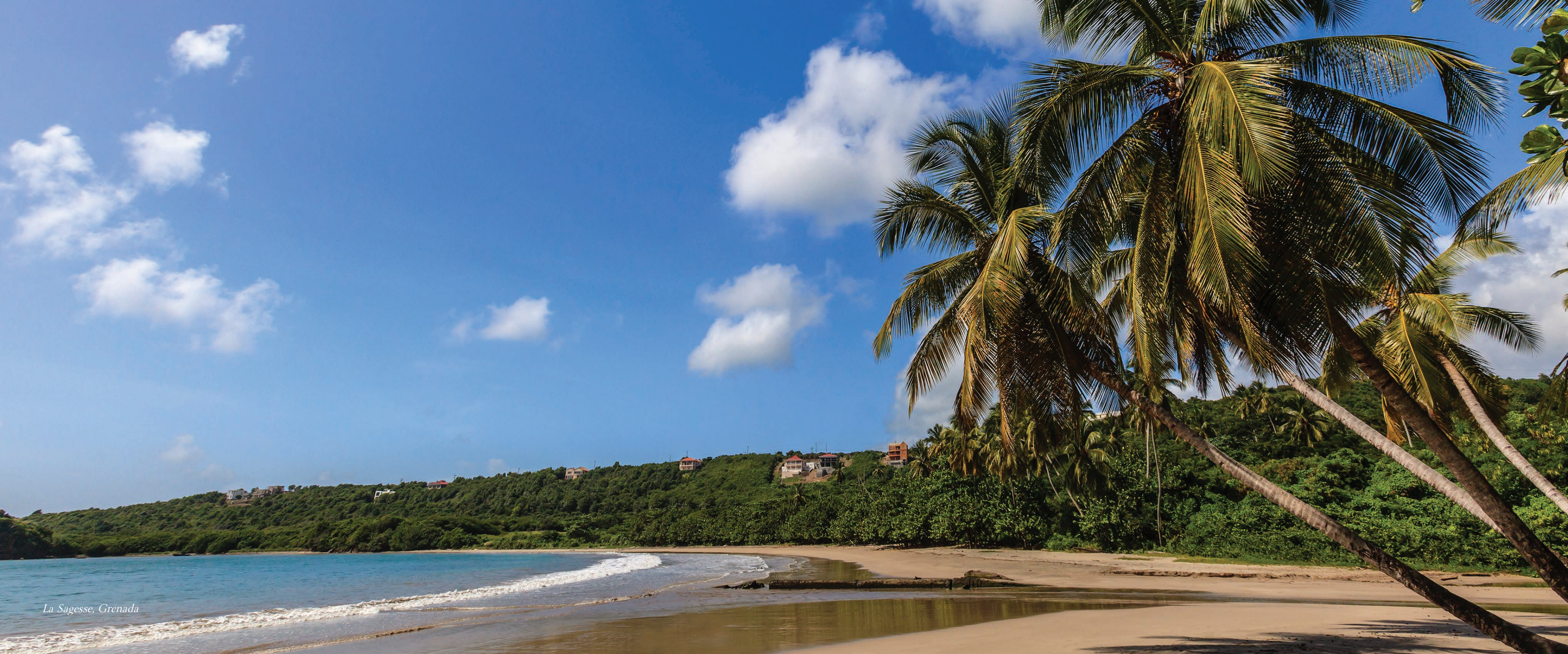
La Sagesse, Grenada