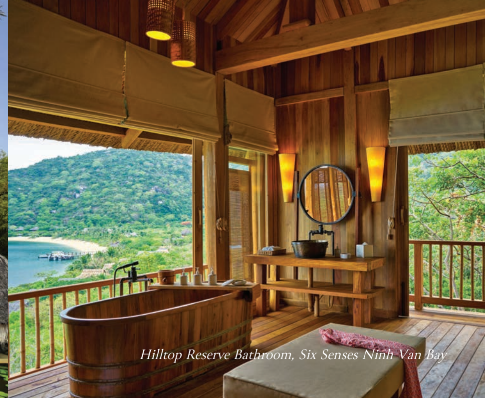
Hilltop Reserve Bathroom, Six Senses Ninh Van Bay