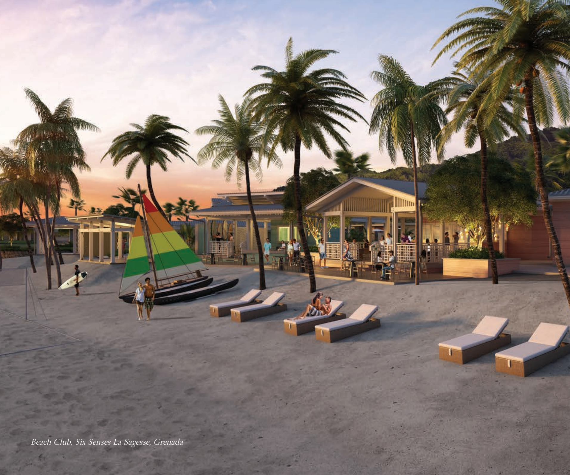
Beach Club, Six Senses La Sagesse, Grenada