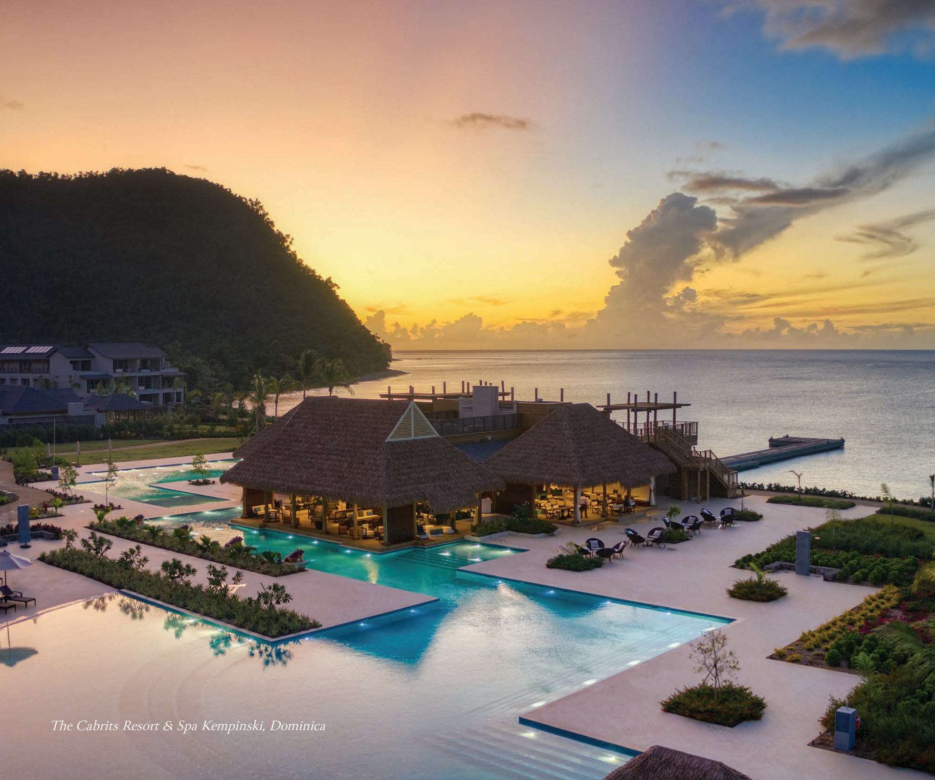
The Cabrits Resort & Spa Kempinski, Dominica