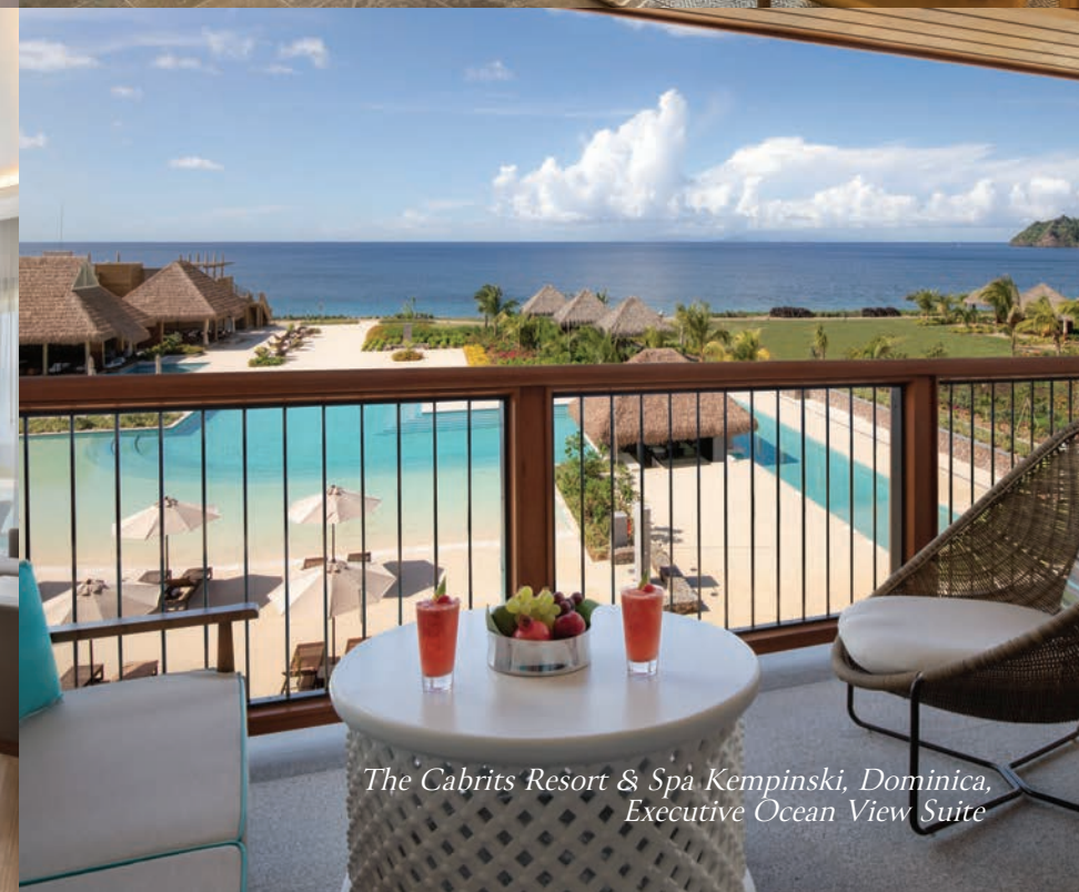
The Cabrits Resort & Spa Kempinski, Dominica, Executive Ocean View Suite