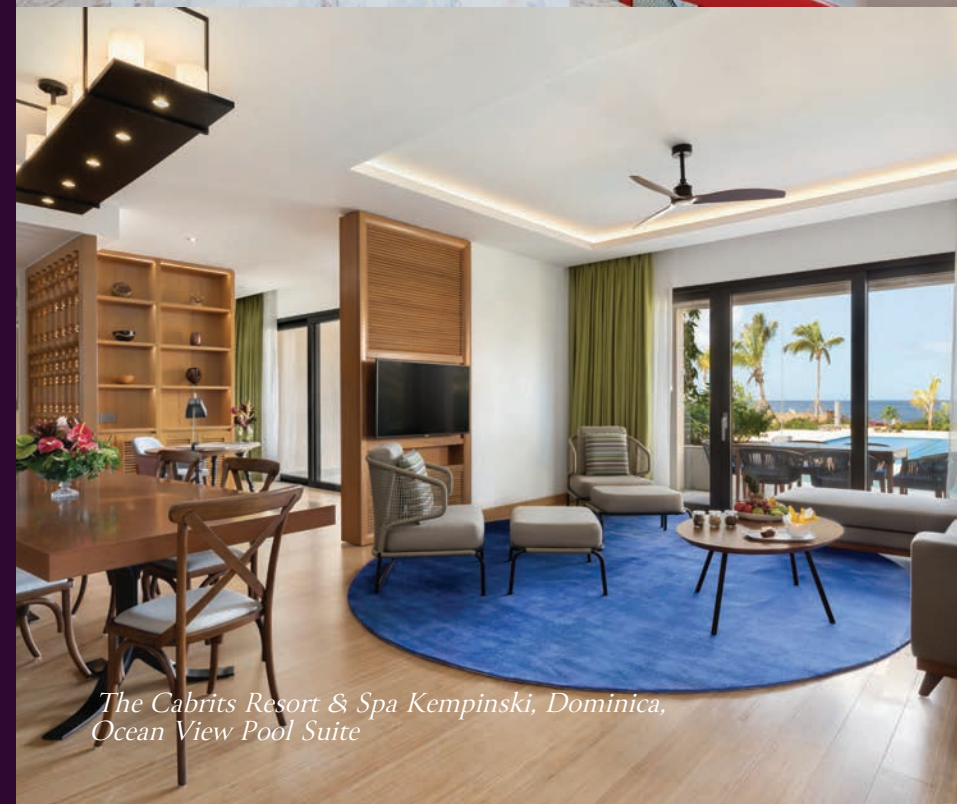
The Cabrits Resort & Spa Kempinski, Dominica, Ocean View Pool Suite