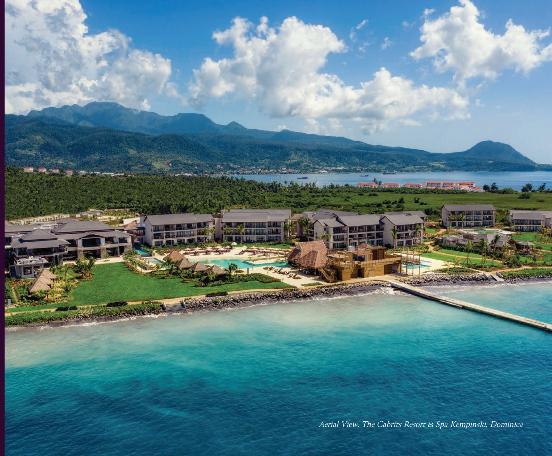
Aerial View, The Cabrits Resort & Spa Kempinski, Dominica