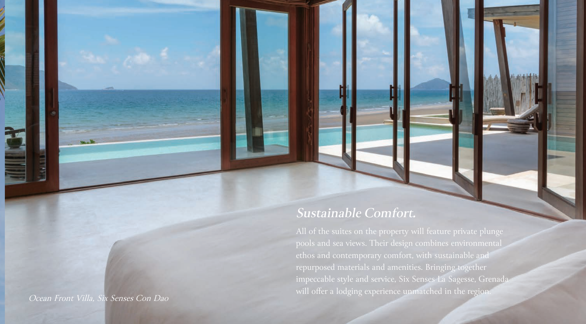
Ocean Front Villa, Six Senses Con Dao

With its fascinating palette of blues and aqua greens, this palm tree-dotted slice of Granada coastline is an artistic blend of the best the Caribbean has to offer.