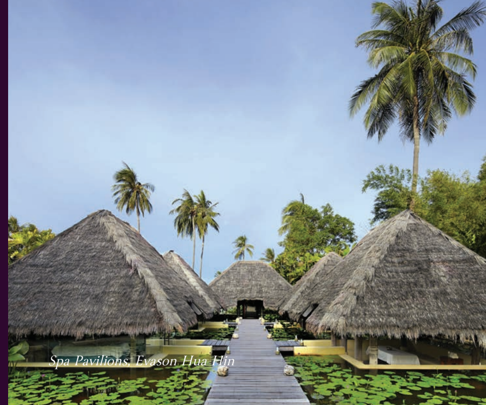
Spa Pavilions, Evason Hua Hin