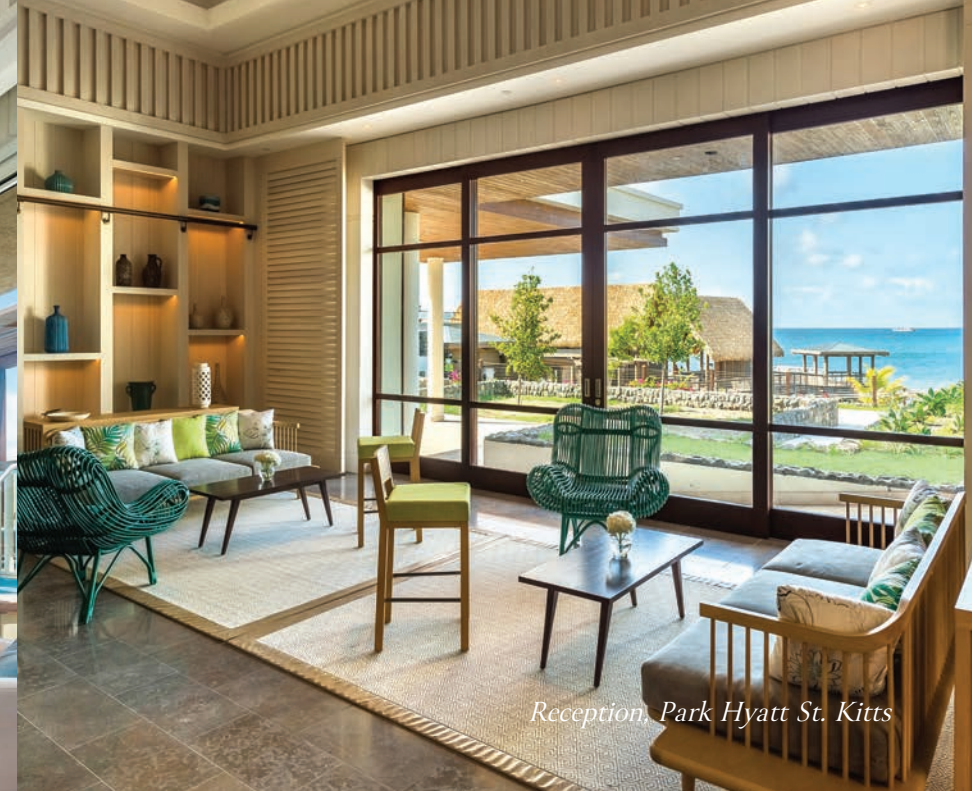
Reception, Park Hyatt St. Kitts