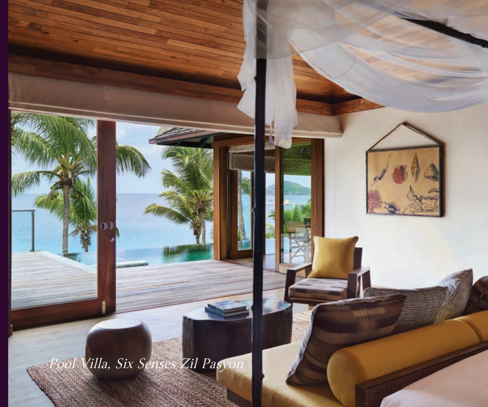
Pool Villa, Six Senses Zil Pasyon