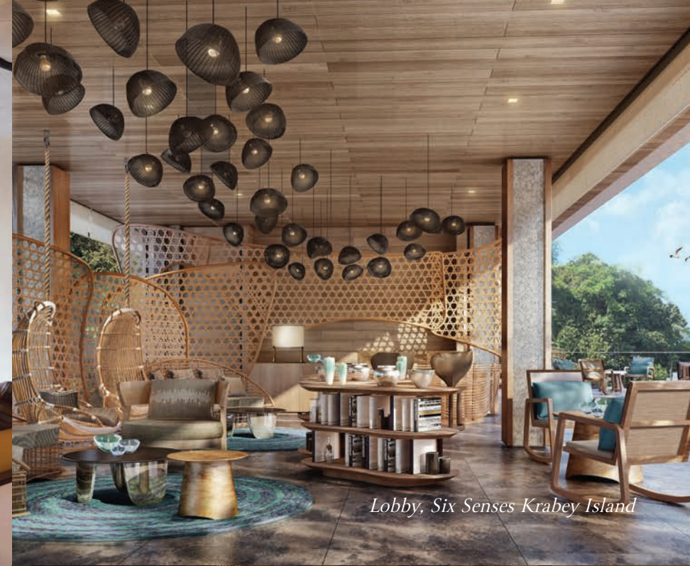
Lobby, Six Senses Krabey Island